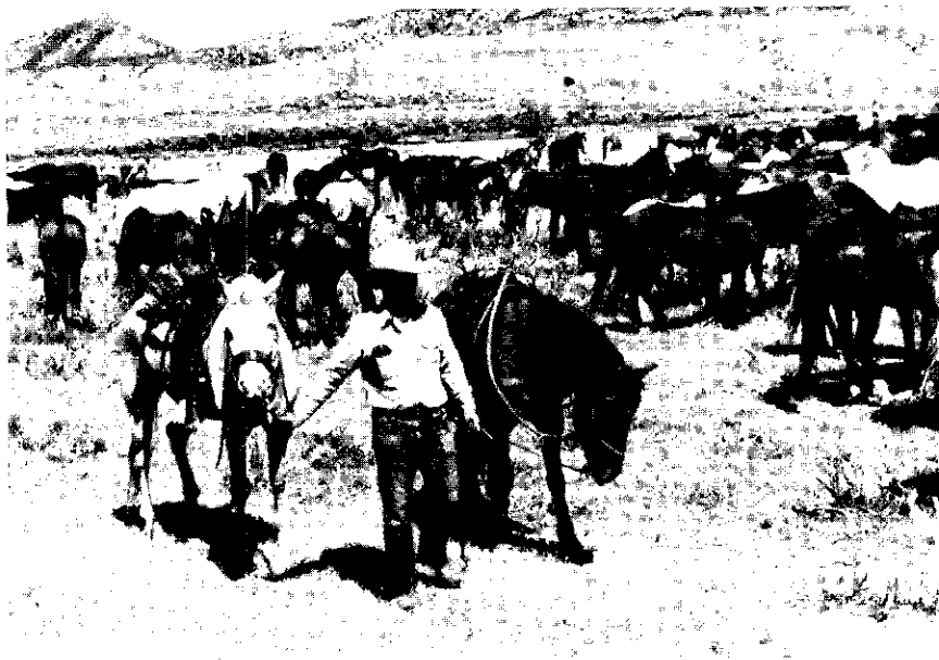
On a long Colorado drive.

Since so many of the problems encountered in working on a horse's feet are due to vices, a good portion of this book is concerned with correcting vicious behavior. Since it is necessary for a horse to be well-behaved before he can be properly trimmed or shod, this book may be regarded as a manual for teaching your horse discipline, self control and good behavior. Such characteristics not only enable a horse's feet to be properly cared for, but also will make him a better mount and a more enjoyable animal to be with.